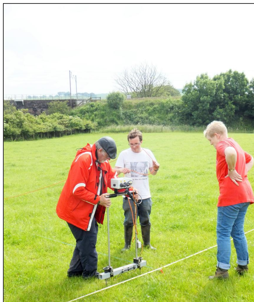
Seeing below the ground: volunteers undertaking resistivity – it's a great way of finding out about buried archaeology.